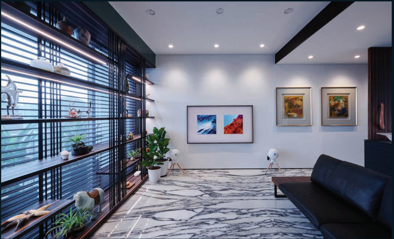
A steel frame display shelf with ebony wood veneer is the highlight of the room