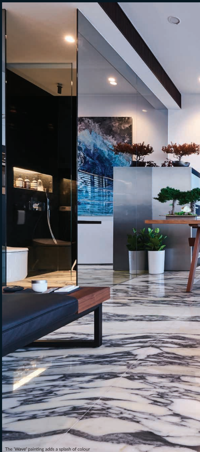
The 'Wave' painting adds a splash of colour