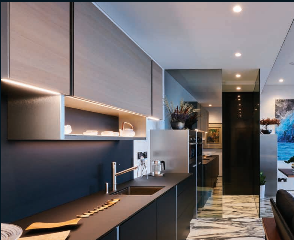
The open kitchen and bathroom liberate the limited interior space